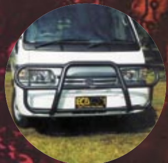
ECONO & MAXIVAN 11/99on TYPE 8 Silver Hammertone

These modern and functional 63mm Series 2 Nudge Bars provide great sports styling and have the height advantage to offer bumper and grille protection. Formed from high tensile alloy tubing, the 63mm Series 2 Nudge Bars come complete with spotlight mounting provisions together with a choice of finishes.