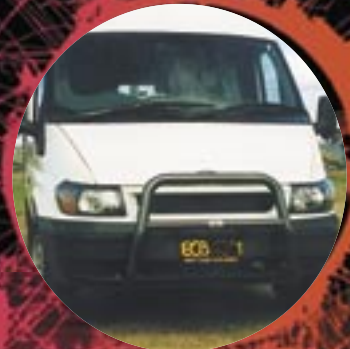
TRANSIT VAN 8/000n - 63mm SERIES 2 NUDGE BAR Silver Hammertone

TRANSIT VAN 8/00on - 76mm NUDGE BAR The sporty 76mm Nudge Bar provides protection from those around town bumps that are often caused by other motorists. Standard with spotlight mounting provisions, this product is a practical addition to your vehicle and is available in a variety of finishes. 76mm Nudge Bar is also available for 97-7/00 models.