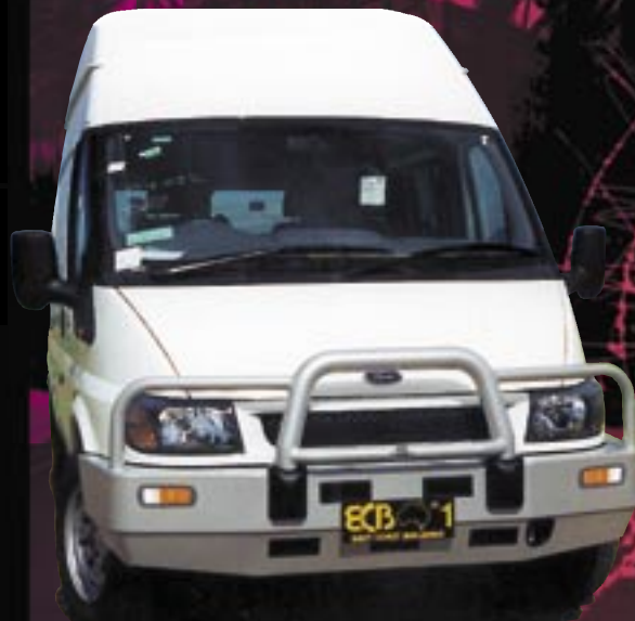
TRANSIT VAN 8/00on - BIG TUBE BAR Silver Ripple

The Ford Transit Big Tube Bar has been designed to deliver the ultimate in safety, protection and style. The high tensile, one piece bumper section incorporates a full width lower skirt for maximum protection. The Big Tube Bar incorporates integrated air directional cooling vents, indicator park light combinations and driving light mounting provisions. A choice of finishes completes a great looking performance product.