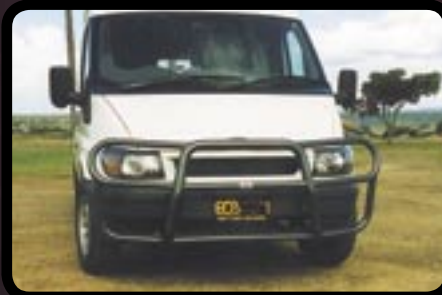
TRANSIT VAN 8/00on - TYPE 8 BAR Silver Hammertone

The Ford Transit Big Tube Bar has been designed to deliver the ultimate in safety, protection and style. The high tensile, one piece bumper section incorporates a full width lower skirt for maximum protection. The Big Tube Bar incorporates integrated air directional cooling vents, indicator park light combinations and driving light mounting provisions. A choice of finishes completes a great looking performance product.