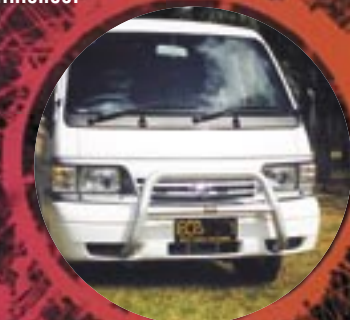
ECONO & MAXIVAN 11/99on 63mm SERIES 2 NUDGE BAR - Silver Ripple

This popular Econo workhorse deserves the complete frontal protection provided by the popular and practical Type 8 bar. Manufactured using high tensile alloy, the Type 8 Bar provides optimum frontal protection in a tubular design of protection bar. The Type 8 Bar easily accommodates driving lights and is available in a choice of powder coat finishes.